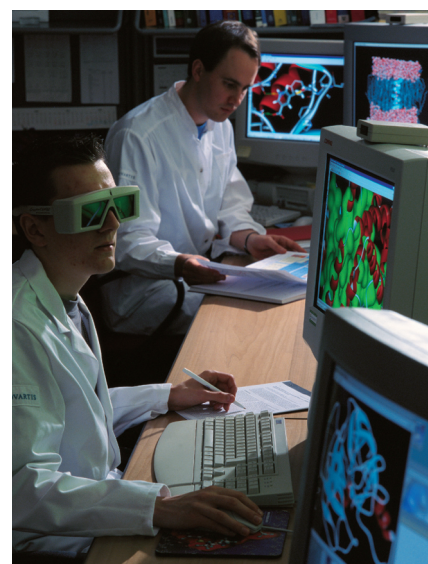
Structural analysis is more commonly a tool of drug discovery research, as shown here at Novartis AG in Switzerland. ( WWW.NOVARTIS.COM )

Among monoclonal antibodies (MAbs), intrachain disulfide differences can affect IgG2 affinities, and different intrachain bonds can