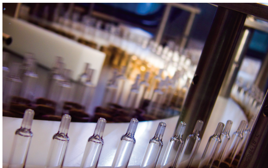
Pharmaceutical production: filling prefilled syringes with NeoRecormon and Mircera

Traditionally, the CaSSS CMC Strategy Forum meetings have provided a scientific focus on the development of biotech drug substances and their manufacture and characterization, leaving the development of drug product formulation and filling, understanding primary containers, and considering novel delivery systems somewhat out of scope. Over recent years, however, the importance of investing more science and technology into drug product development has become evident as different product types, higher protein concentrations, and doses and requirements for improved delivery of biological drug products have increased. The need to give patients larger and more concentrated doses has challenged formulation scientists, who now collaborate with early protein scientists to develop sequences at the earliest stages of